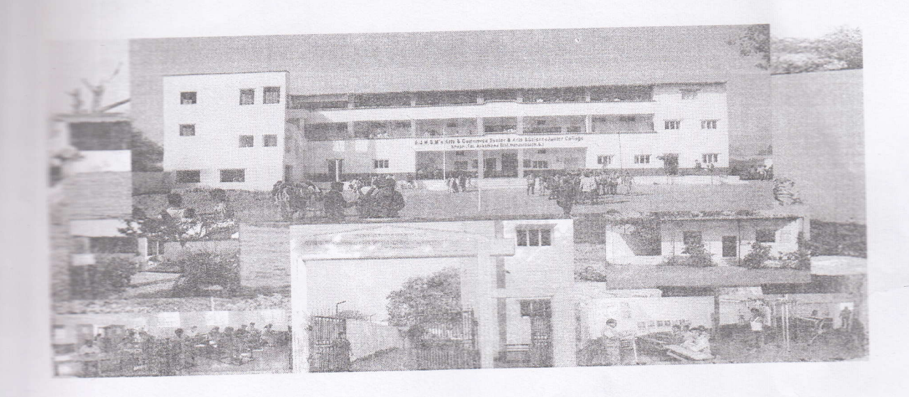
Criteria – 6 Governance, Leadership and Management